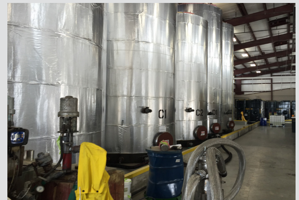
Figure 2 Tank Farm and Plural Component Equipment Used for Application

HP-410 Novo was applied to all 12 storage tanks to ensure more batches of product would not be destroyed by impurities. The project was completed on-schedule and on-budget, and the tanks have been in service without any issues for over 4 years.