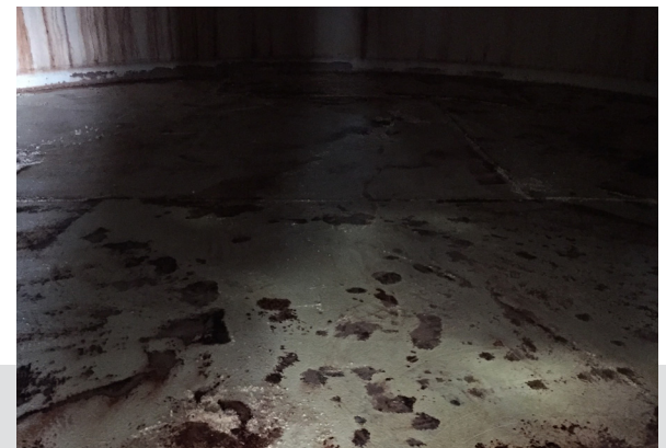
Figure 1 Failed Coating System Inside of Storage Tanks

A new tank farm was installed to handle the storage and distribution of specialty hydrocarbon products for KL Chempak in Houston, TX. The tanks stored alkyl phenol, purified fatty acids, and other materials. When the first load of chemicals was removed from the tank, the product was discolored and flakes of coating were found. Upon inspection of the tanks, the polymeric coating had completely failed, showing indications of chemical attack as it was swollen and soft to the touch. In order to protect the tank and purified products, a more chemically resistant coating was needed.