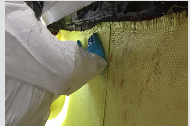
Figure 2 Installation of the Kevlar Reinforcement Fabric

The customized coating system was installed successfully during a cold New England winter, on-time and on-budget. The material has been in service without any leaks or issues for over 2 years.