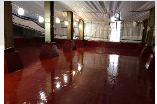
Figure 3 Final Basin After Application of the HP-300 Elastomer

The customized coating system was installed successfully during a cold New England winter, on-time and on-budget. The material has been in service without any leaks or issues for over 2 years.